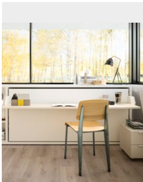
KALI BOARD 90