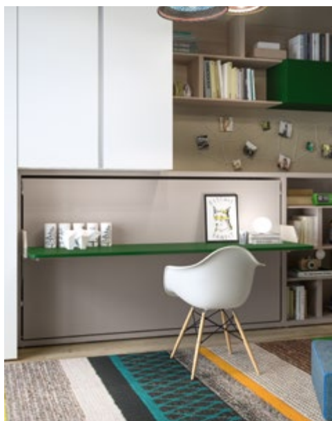
KALI BOARD 120